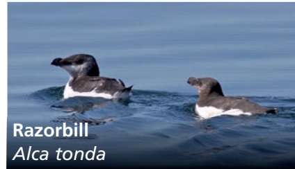
Razorbill Alca tonda