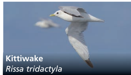
Kittiwake Rissa tridactyla