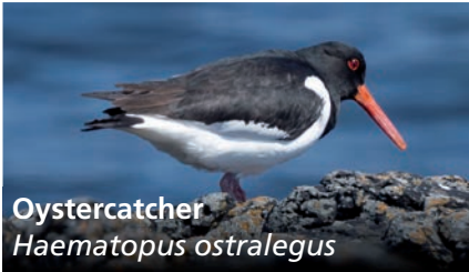
Oystercatcher Haematopus ostralegus

PLEASE LEAVE ON THE BOAT – YOU CAN DOWNLOAD A COPY FROM OUR WEBSITE!