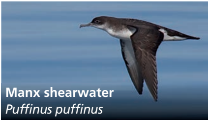
Manx shearwater Puffinus puffinus