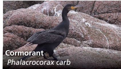
Cormorant Phalacrocorax carb