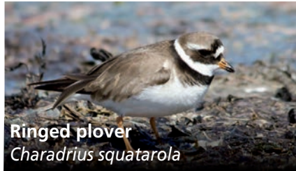
Ringed plover Charadrius squatarola