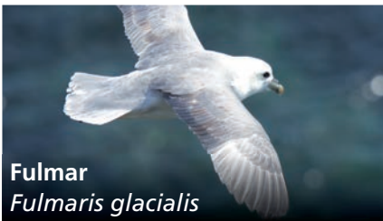
Fulmar Fulmaris glacialis