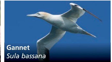
Gannet Sula bassana