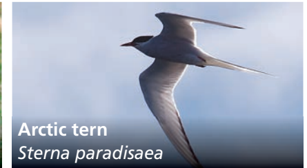
Arctic tern Sterna paradisaea