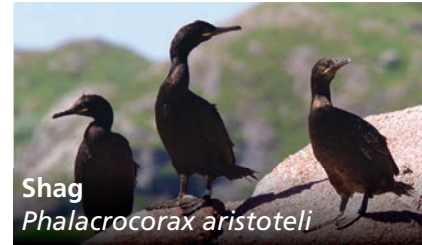
Shag Phalacrocorax aristoteli