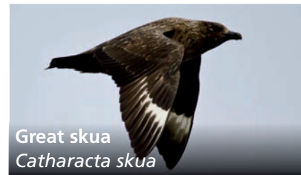
Great skua Catharacta skua