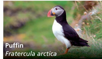
Puffin Fratercula arctica